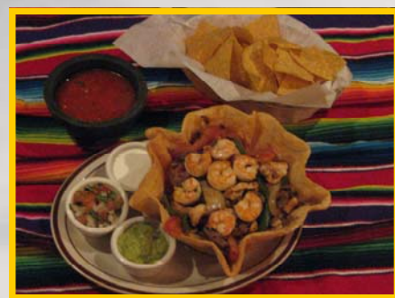
Tres Amigos Salad

Crisp tortilla shell filled with grilled chicken served over a bed of lettuce, garnished with sliced tomatoes and onions. 7.99