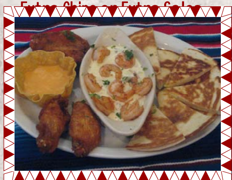
Panchos Appetizer Combo