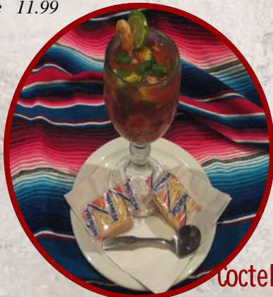
Coctel De Camarone

Two grilled tortillas filled with shrimp, onions, tomatoes, green peppers and cheese 11.99